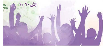
Riseup now Europe

After the blessed "Rise-Up Now" conference in Milan last June, the leadership of Rise Up Now Europe decided to have a time of consultation to pray and seek God together about what the next steps should be in the coming two years. These three days were very blessed. Both European leaders and Arab leaders took part. The Rise-Up team members feel the urgent Call to reach the Europe with the Gospel of Jesus Christ, working together as Europeans and Arabs. Plans were made to organize a European Conference in Germany in May/June 2017 and in 2018 in the Netherlands. The leadership teams for these conferences were formed and blessed. If you want more information, please see the website http://www.riseup-now.com/ or on Facebook https://www.facebook.com/Riseup-Now-985153701551193/?fref=ts